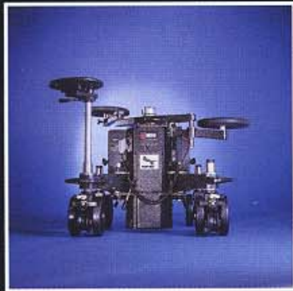
Super Panther III